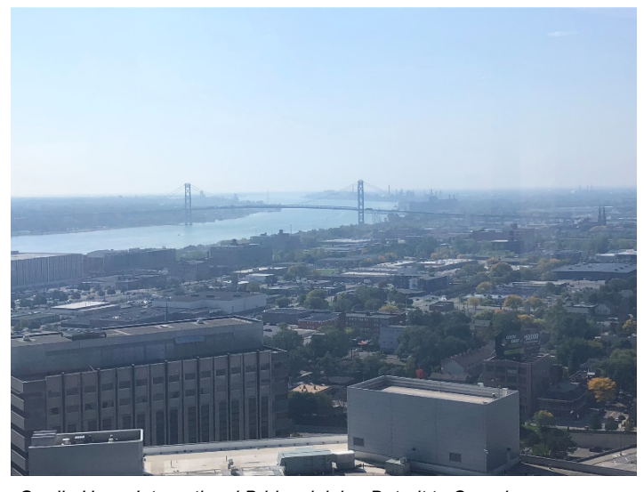
Gordie Howe International Bridge, joining Detroit to Canada.