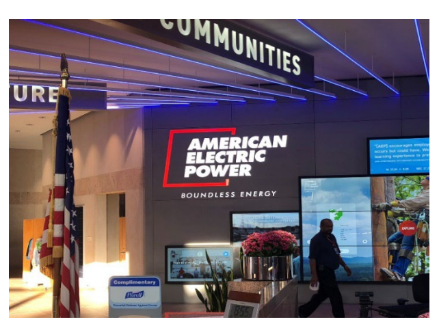
The foyer of American Electric Power.

Travelling two hours to Akron, we then met with the management team of First Energy (FE). One of the