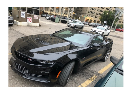
Potentially representative of a hire car in the "Motor City" of Detroit.

For at least the last 10 years the utilities in Michigan, CMS and DTE Energy , have developed a track record as some of the best operational and financial performers in the industry. This has been attributed to: