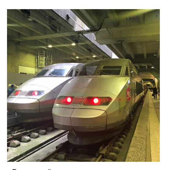
European rail

Low growth, de-risked assets and failed expansions are available for sale, with infrastructure operators using an asset rotation strategy to fund further growth.