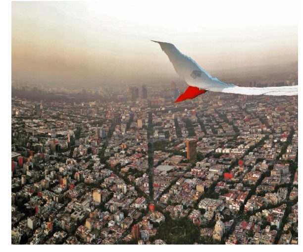
Mexico City from the air