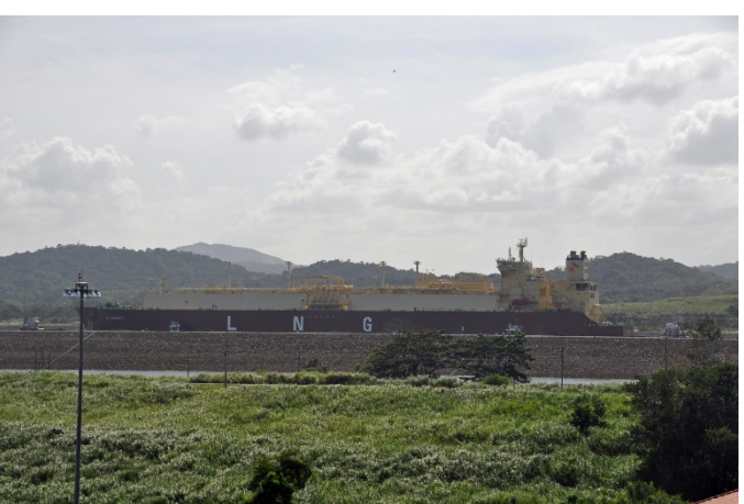
LNG tanker on Panama Canal

Brazil continues to need more generation capacity with the operators focused on diversifying their sources away from hydro via investments in wind and solar plants.