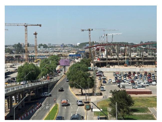
Santiago airport construction

The other big overhang for Mexico in 2018 was the North American Free Trade Agreement (NAFTA), with the consensus view in January of a renegotiation over a cancellation, given the latter would have negative ramifications for both Mexico and the USA. This proved to be the case, with Trump posturing